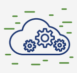
Virtualization & Automation