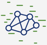
Networking & Switching